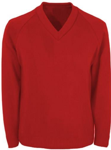
Fleece with school logo